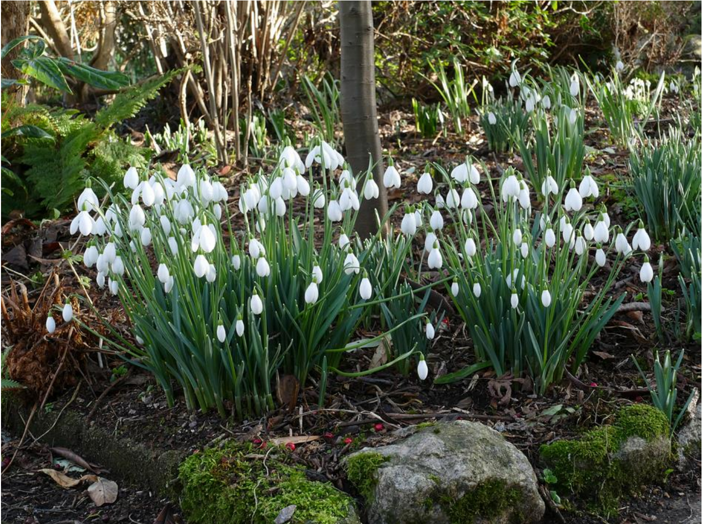
These are some of a number of clumps of Galanthus that have become so large that the bulbs will be in competition for the nutrients so to maintain good flowering they will need to be lifted and divided before long.