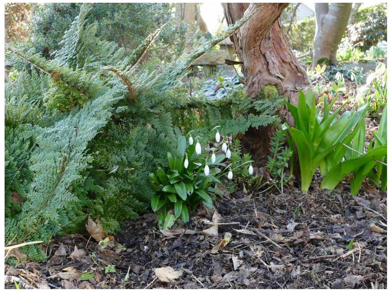
Galanthus woronowii peaks out from under a fern the fronds of which I will reluctantly cut off in a few weeks to encourage the new season's growth.