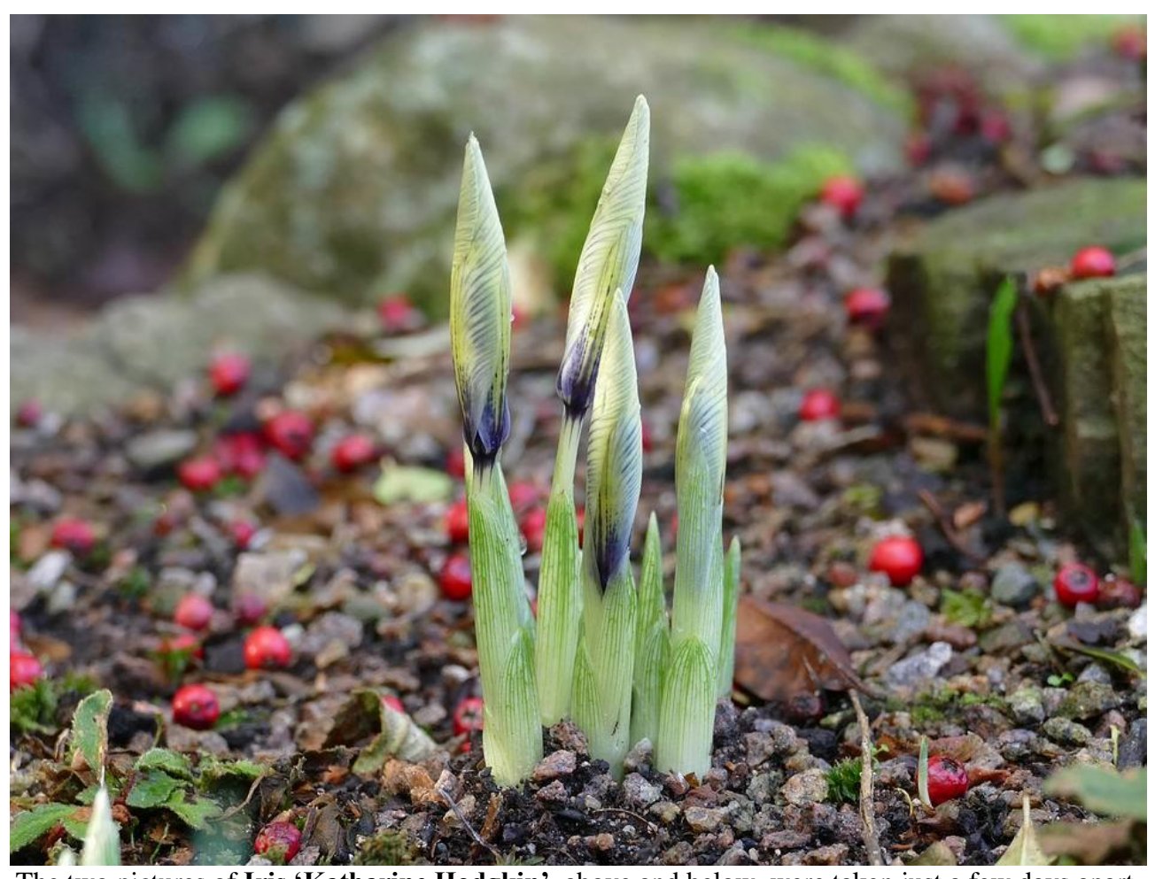
The two pictures of Iris 'Katharine Hodgkin', above and below, were taken just a few days apart.