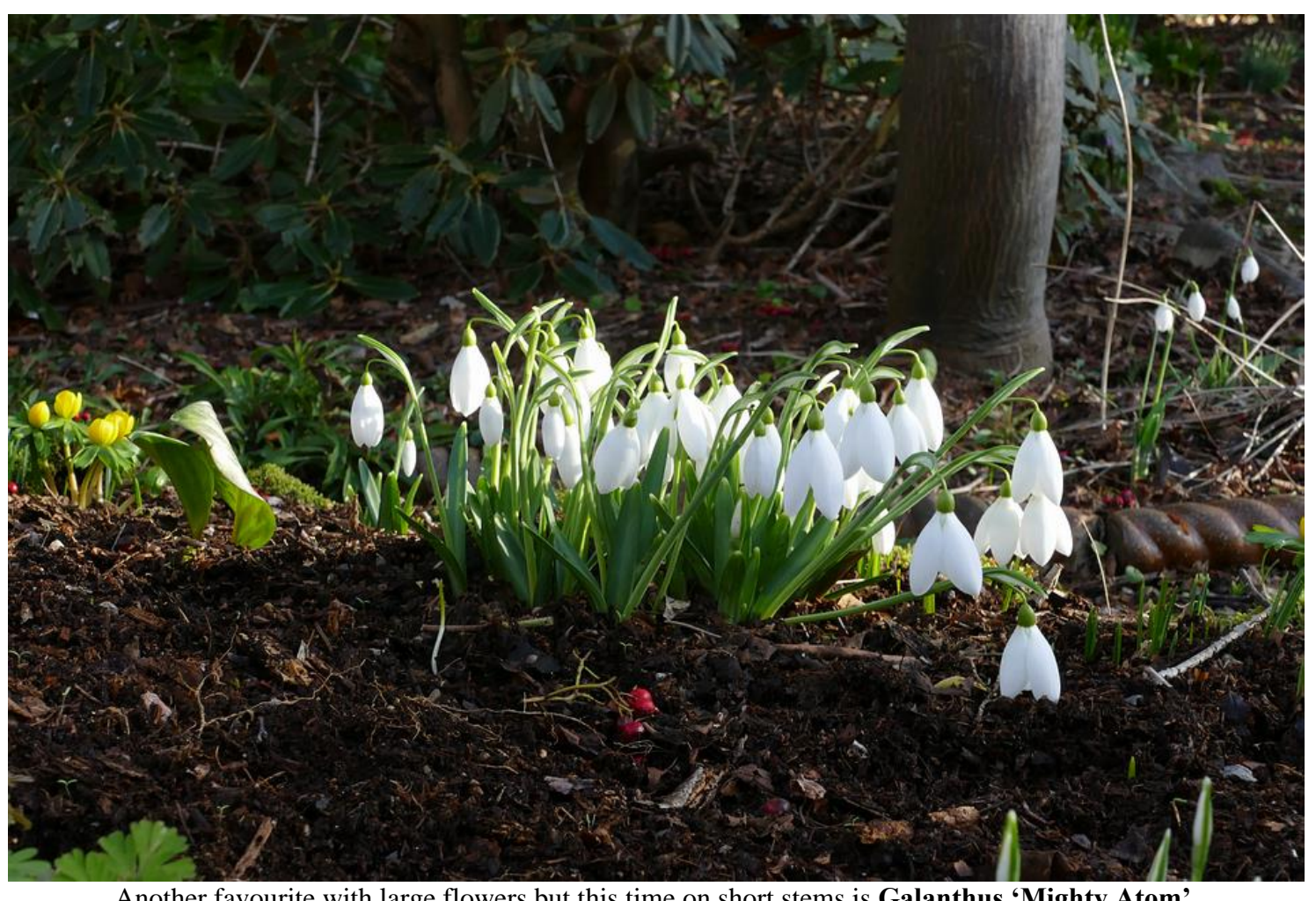
Another favourite with large flowers but this time on short stems is Galanthus 'Mighty Atom'.