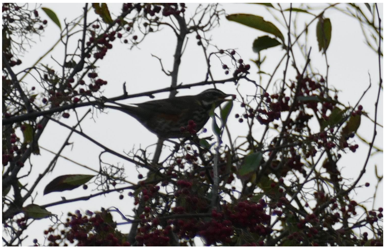
You will have noticed the scattering of red Cotoneaster berries in the previous pictures which are attracting large flocks of Red Wing birds into the garden to feed.