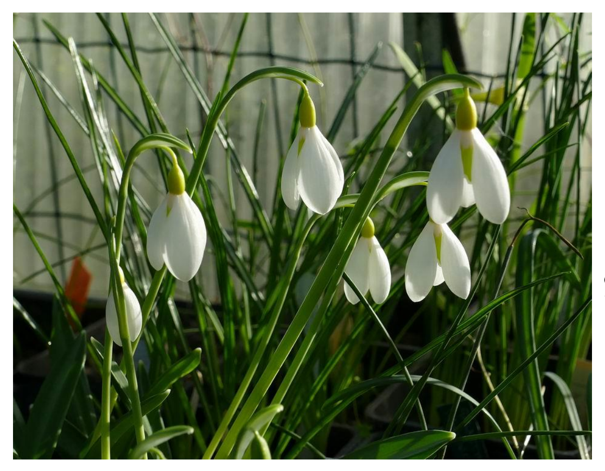
Galanthus plicatus 'Wendy's Gold'