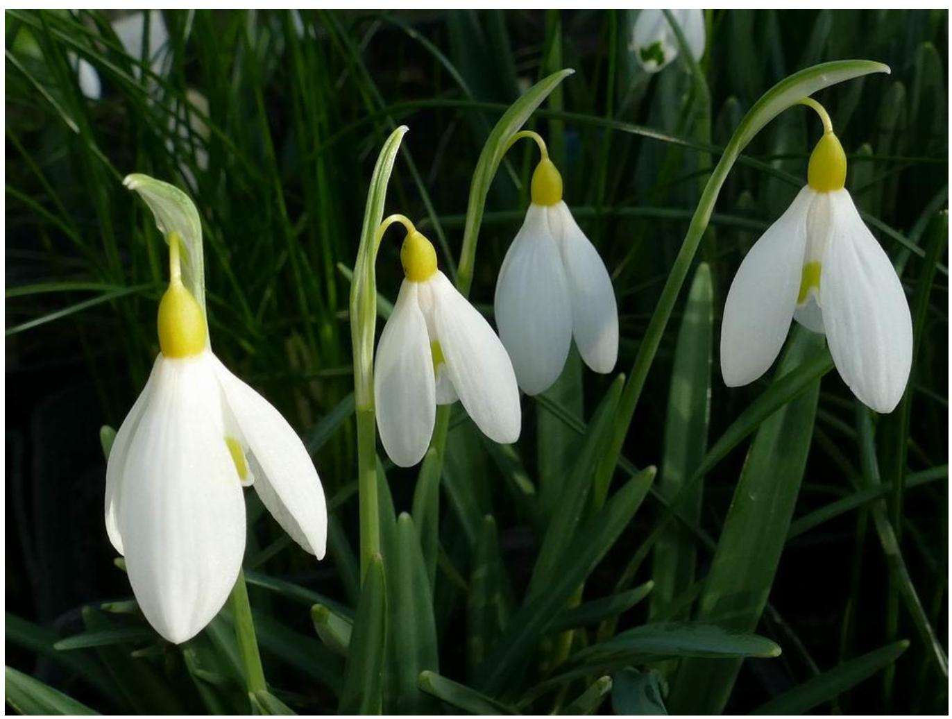
Galanthus 'Dryad Gold Bullion'

When we grow plants, including Galanthus, in pots we do use labels but once they are planted out into the garden the labels are thrown away. My belief is that if they are distinct enough to stand out from the many then I will easily be able to recognise them but if they have no clearly distinctive feature then perhaps they do not deserve a name in the first place.