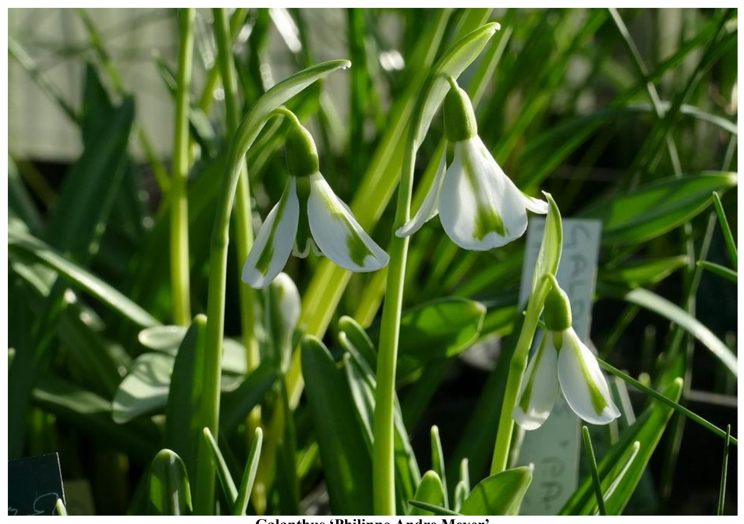
Galanthus 'Philippe Andre Meyer'