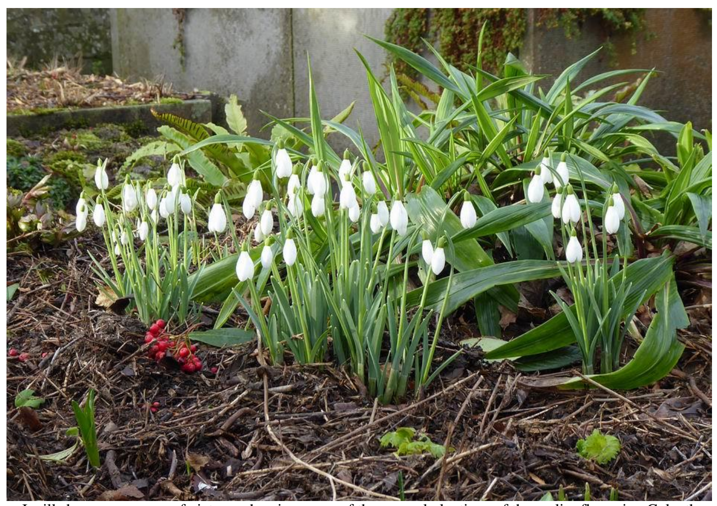
Now I will show a sequence of pictures showing some of the general plantings of the earlier flowering Galanthus.