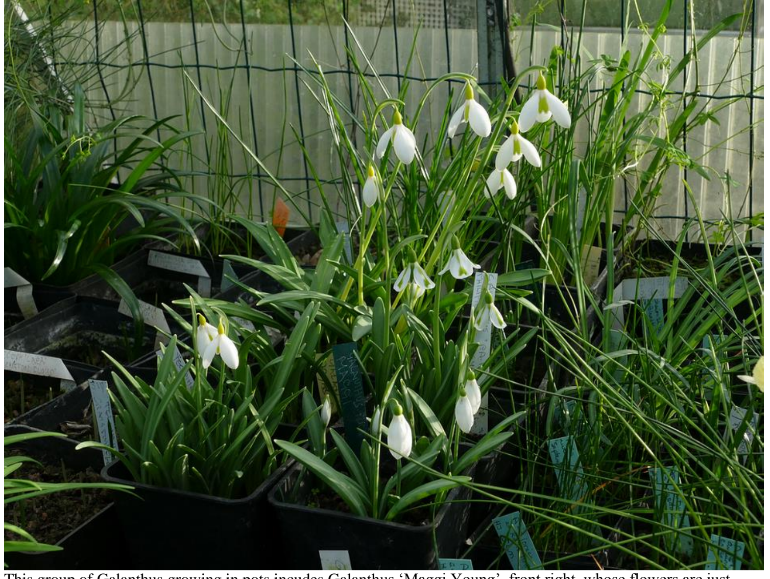
This group of Galanthus growing in pots incudes Galanthus 'Maggi Young', front right, whose flowers are just opening