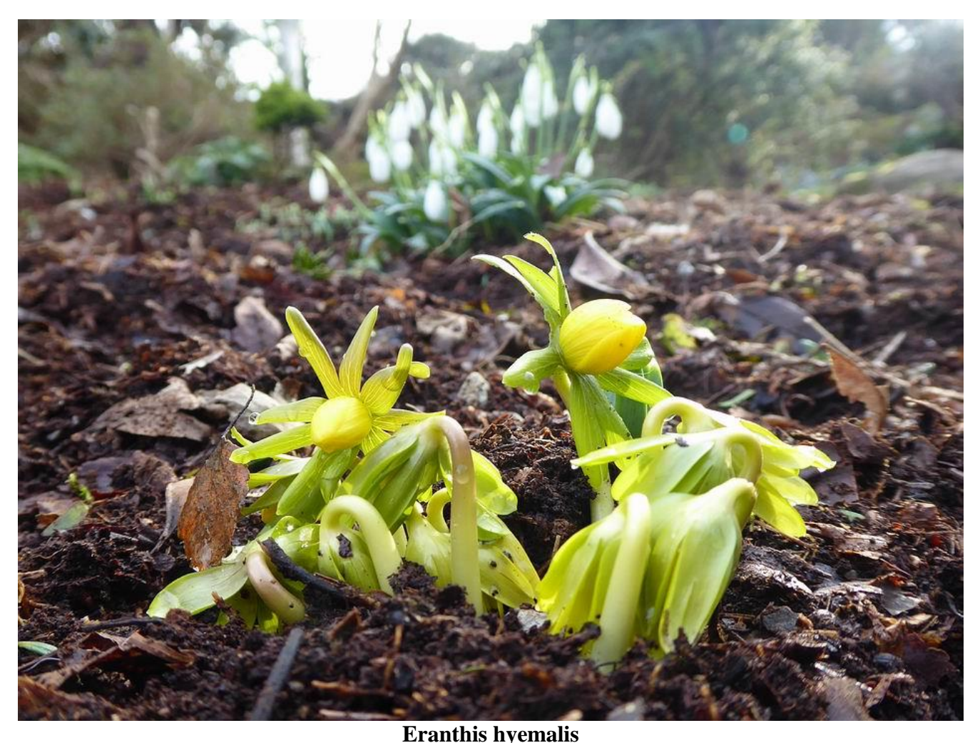
Eranthis hyemalis Much to our delight Eranthis hyemalis flowers in their various shades of yellow are also gracing the garden.