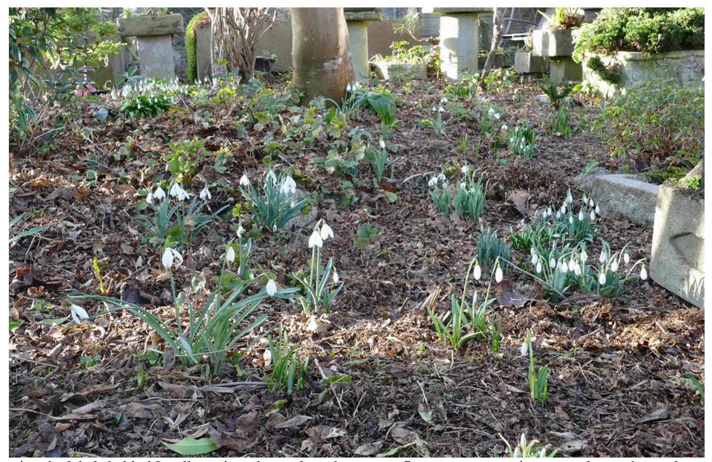
Leaving the labels behind I walk out into the garden where more flowers are appearing every day as the garden emerges from its winter state.